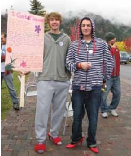
2009 Walk the Walk participants in festive red shoes!