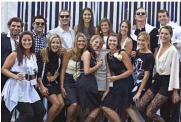
Gala revelers at the Black & White Soirée.