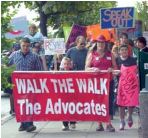
Domestic Violence Awareness Month Rally