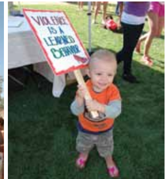
Community members of all ages speak out